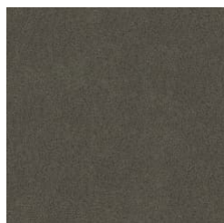
98 WARM GREY