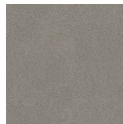
90 MEADOW MIST