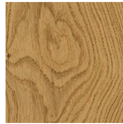
300 NATURAL OAK SMOOTH