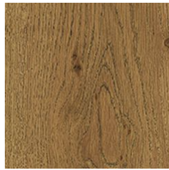
360 RUSTIC OAK