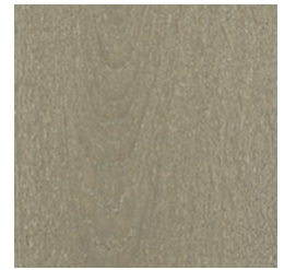
710 ASHEN OAK