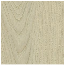
560 WEATHERED OAK