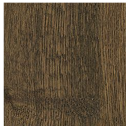
180 COFFEE OAK