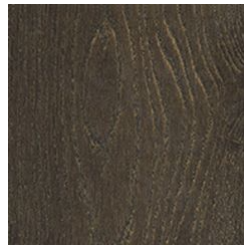
790 CINDER OAK