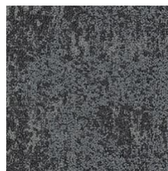
949 WESTERN SCREECH