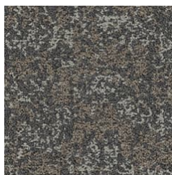
829 GREAT HORNED