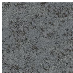
938 EASTERN SCREECH