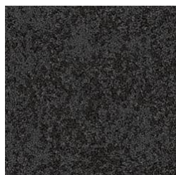
969 GREAT GREY