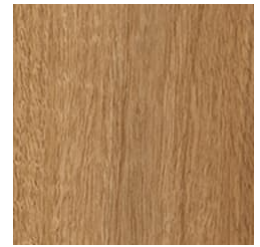
556 SPOTTED GUM