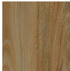
555 SPOTTED GUM