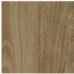
585 MALLEE GUM