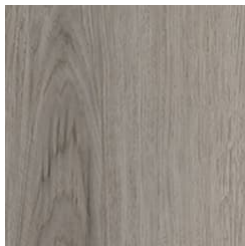
720 COOL GREY