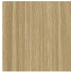
525 ALPINE BLACKBUTT