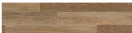
COASTAL SPOTTED GUM