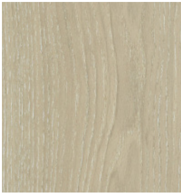
Celtic Snow 801