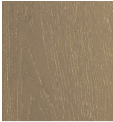
River Oak 802