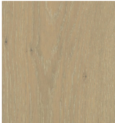
Fawn Oak 805