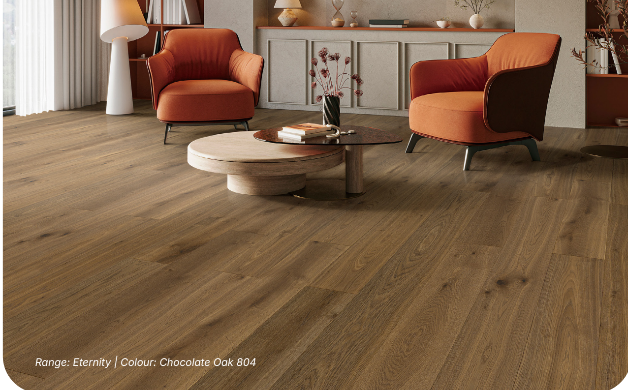
Range: Eternity | Colour: Chocolate Oak 804