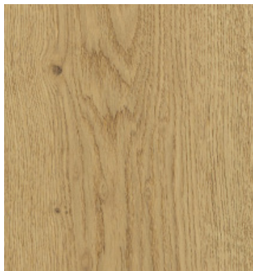
Blonde Oak 808