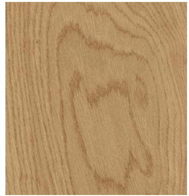
Cashew Oak 803