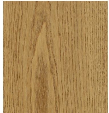
Natural Oak 806