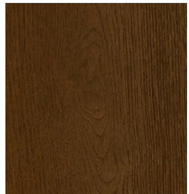
Chocolate Oak 809