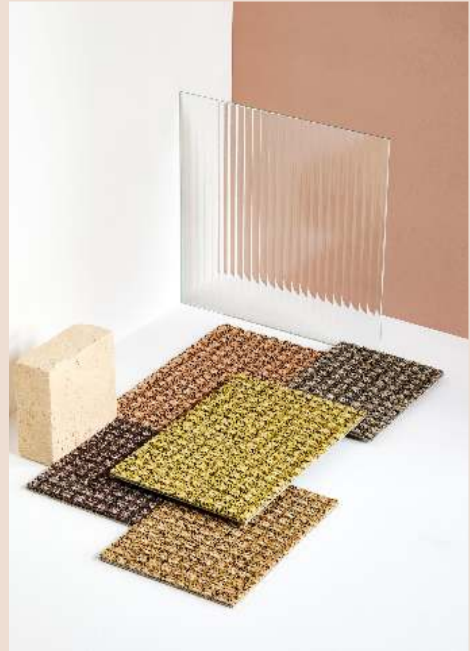
DESSO & PATRICIA URQUIOLA 6218, 5423, 6023, 2913, 2932

The collection comprises twelve different colours, forming a spectrum of neutrals, toned-down shades and accents to choose from. The colours in the collection allow for various mixing and matching and can be installed to create different effects, suiting the diverse spatial needs.