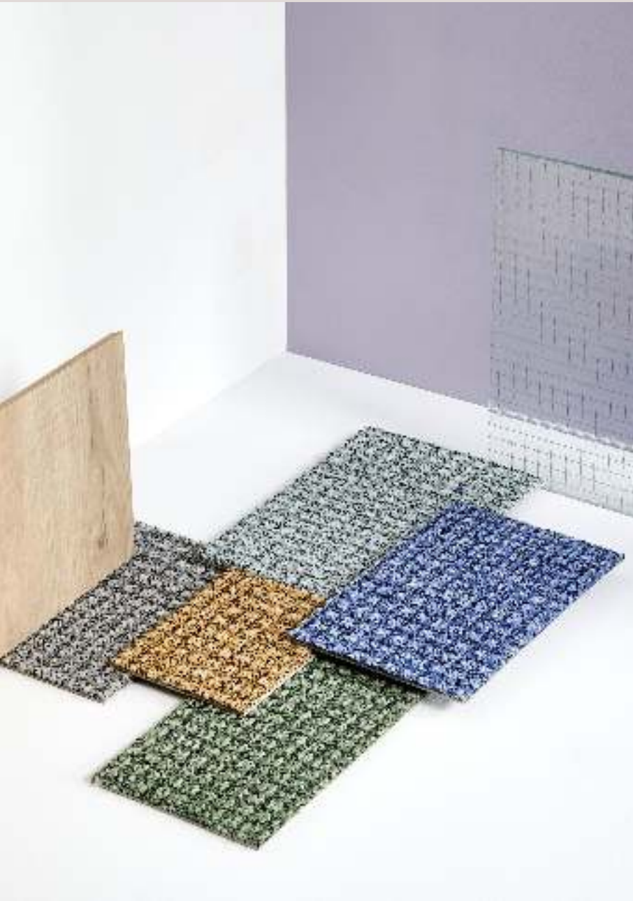
DESSO & PATRICIA URQUIOLA 8423, 7915, 9935, 7843, 6023