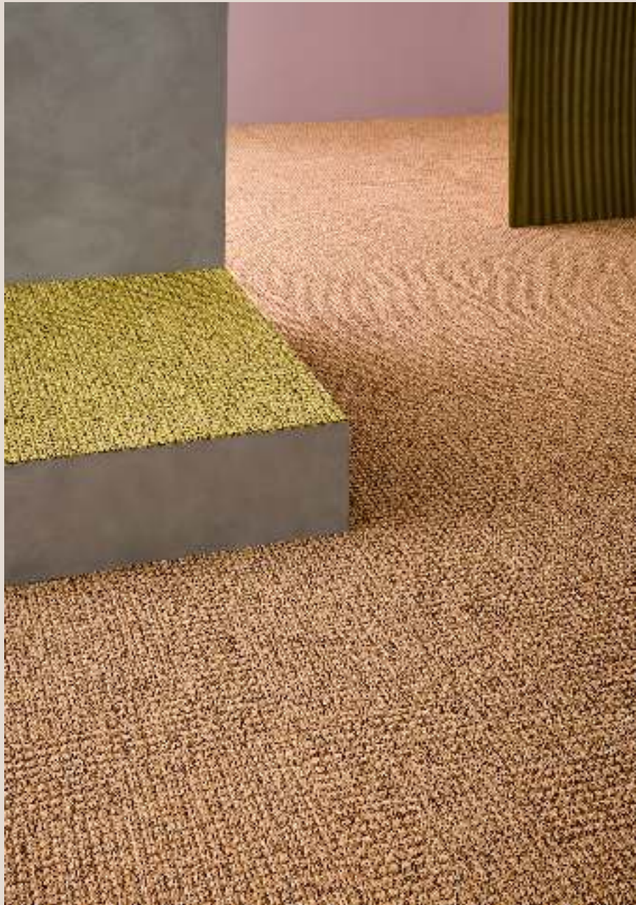
DESSO & PATRICIA URQUIOLA 6218, 5423

DESSO & PATRICIA URQUIOLA 6218 DESSO & PATRICIA URQUIOLA 5423