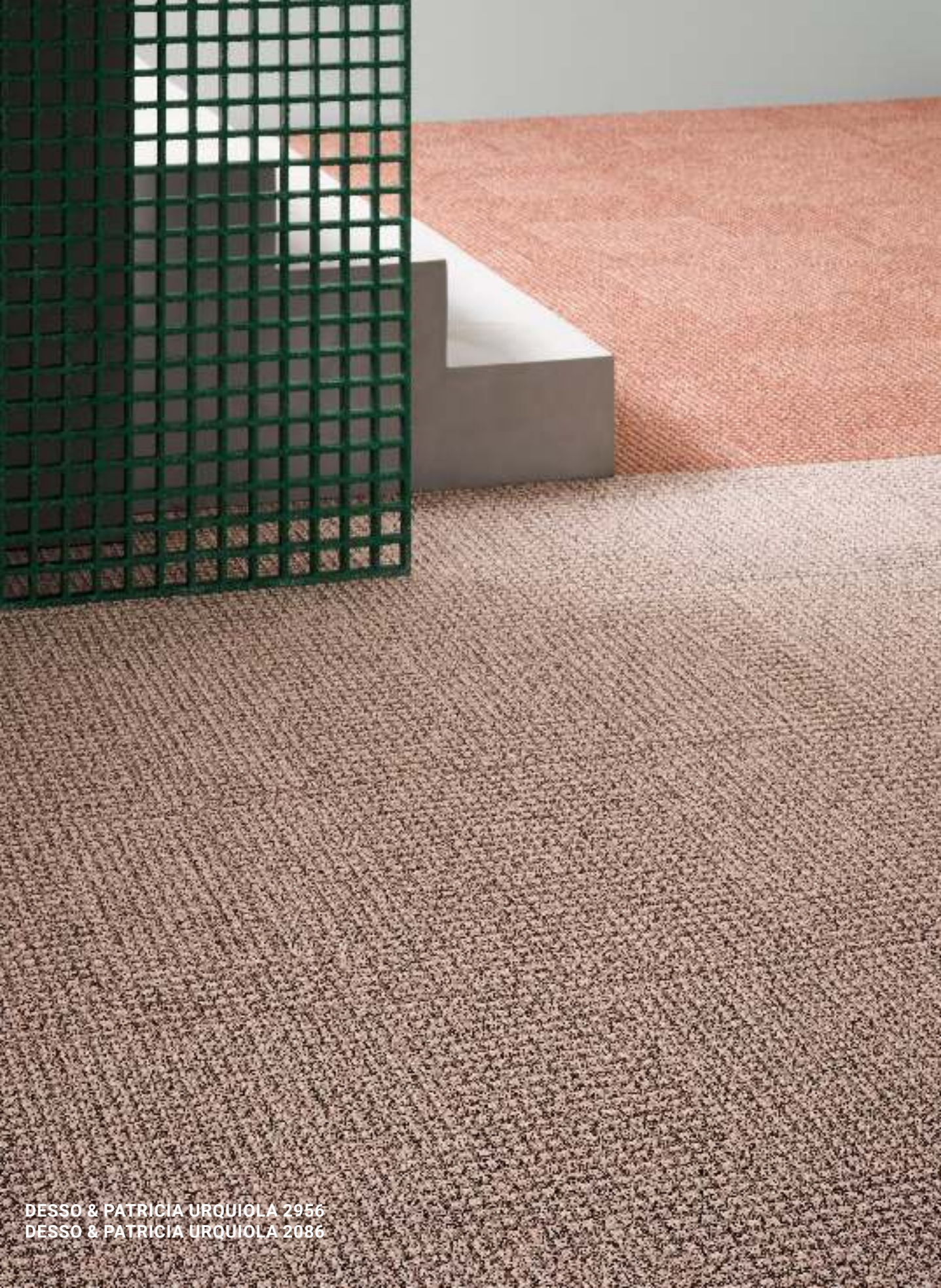
DESSO & PATRICIA URQUIOLA 2956 DESSO & PATRICIA URQUIOLA 2086