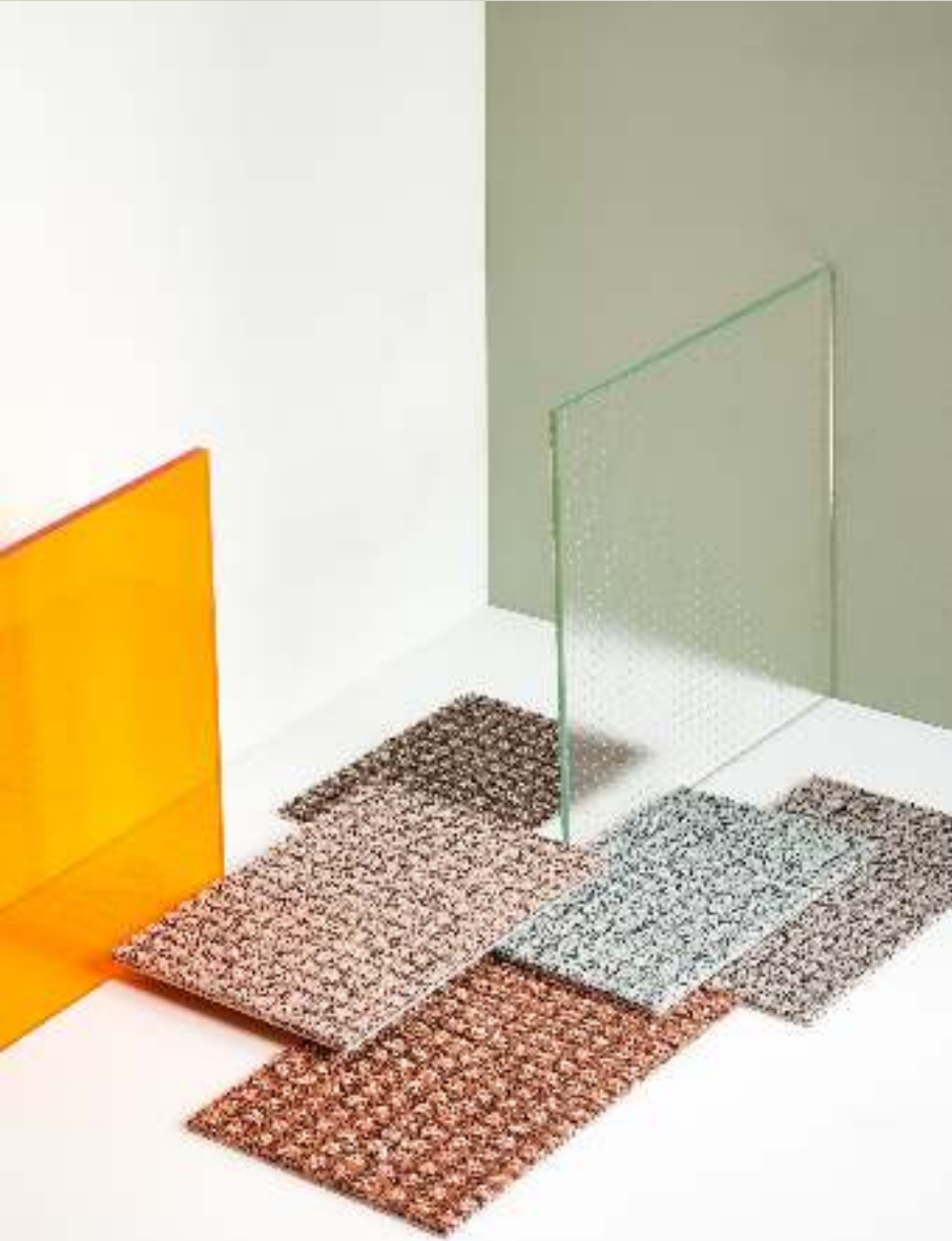
DESSO & PATRICIA URQUIOLA 2956, 9116, 2086, 2932, 7915